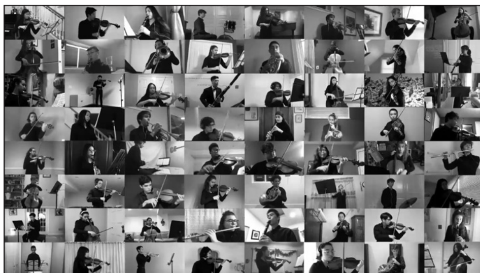
PS video screenshot from Coronation March

https://youtu.be/TzxIo7DYmQ0 (Coronation March) and https://youtu.be/BtPnq9IEguA (Dance of the Tumblers).