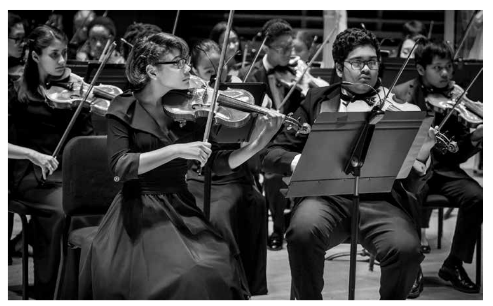
PSP in concert in Verizon Hall. May 2016