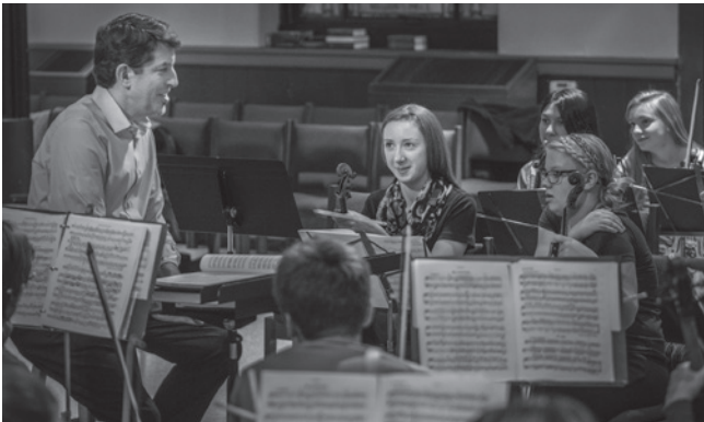
Philadelphia Sinfonia Chamber Orchestra Rehearsal: November 2015

Perhaps always, but certainly in the contemporary world, successful musicians bring versatility, a breadth of musical experiences, openness to new ideas, creativity, initiative, and finely tuned collaborative instincts to their careers.