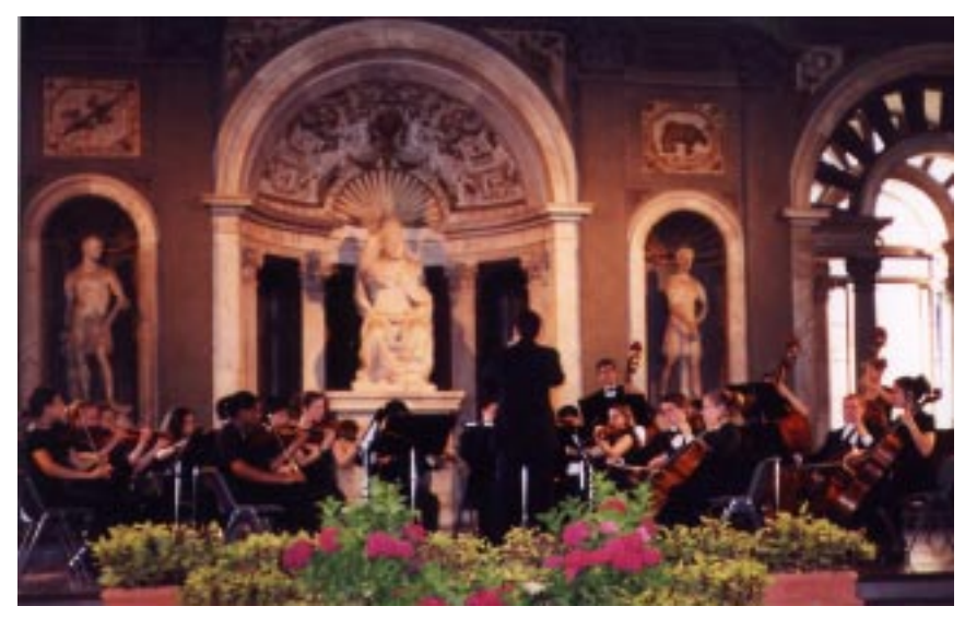
Palazzo Vecchio in Florence

Ladies, check out www.concertblack.com for some stylish concert wear, or, if you're a bargain hunter, cross the Ben Franklin Bridge to shop at The Village Thrift in Pennsauken, NJ, which has racks and racks of black skirts, pants, and tops.