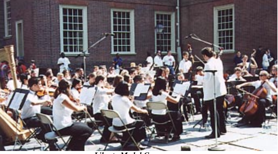
Liberty Medal Ceremony

The highlights of the past decade are numerous and memorable: