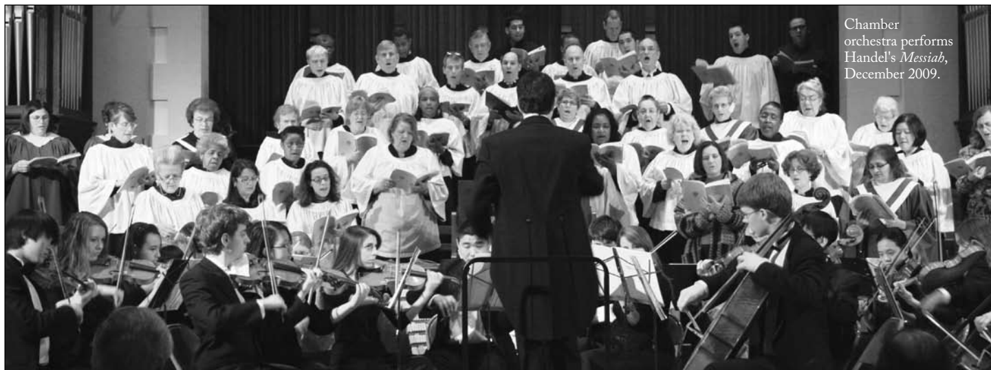
Chamber orchestra performs Handel's Messiah , December 2009.