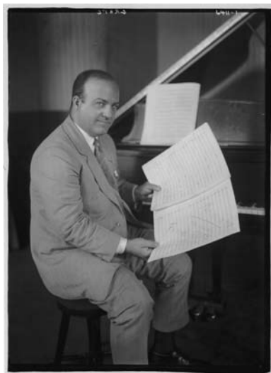
American composer, Ferde Grofé, with the manuscript of his popular Mississippi Suite .