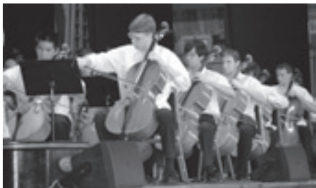
From the best of Sinfonia's photo-archive: 2010; in concert at The Mann Center for the Performing Arts.

The new look you see reflects the mature orchestra we have become: record auditions and membership, strikingly rich and efficient rehearsals, a second side-by-side partnership with The Philadelphia Orchestra, extensive sectional work, masterful performances of orchestral benchmarks such as Mahler's Symphony No. 1 , collaborations and educational partnerships with organizations like Network for New Music, The Mann Center for the Performing Arts, and the newest good idea in music – Play On, Philly!, a national youth orchestra award, global travels with packed concert halls, and civic engagement here and abroad.