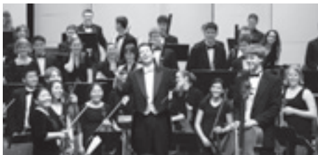
From the best of Sinfonia's photo-archive: 2009; curtain call in Buenos Aires.